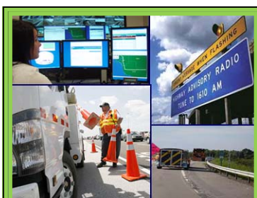
The District One ITS Program uses ITS field components to manage traffic along I-75

These components are connected to the SWIFT SunGuide Center to help traffic operators manage incidents quicker and post more up-to-the-minute traffic information to keep the roadway free and clear of road blocking events and maintain safety. Managing these efforts is critical to the livelihood of the community since drivers who are informed about highway conditions in advance can make better route planning decisions and avoid congestion. ITS advises motorists about slowing-moving traffic, lane closures, and weather conditions like fog or smoke affecting visibility. Managing incidents in a timely manner is equally as important since it restores the highway back to regular operating conditions, reduces secondary crashes and allows first responders to manage more events along the highway.